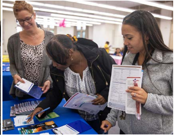
Staff members take advantage of the opportunity to gather need-to-know information about the wealth of employee benefits available at the College.