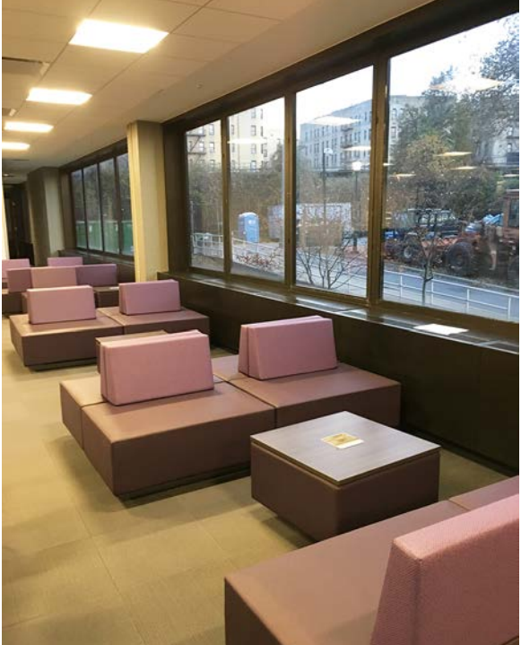
The new first-floor design features state-of-the-art technology and flexible seating areas to facilitate group study.