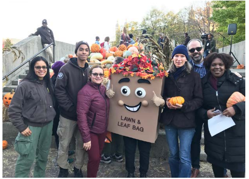
A&F staff members enjoy the annual Pumpkin Smash.

In addition to the NYC Compost Project and the New York Botanical Garden, Corbin Hill Farm Share, the Herbert H. Lehman Food Bank and a number of student clubs participated to help raise awareness.