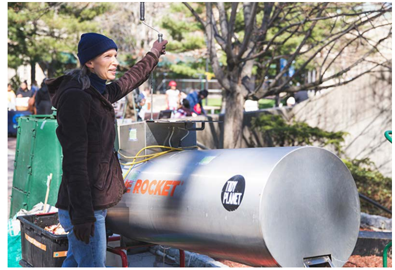
The Rocket was the first phase of food-scrap composting at Lehman. In service since 2009, the Rocket processes 15+ tons of starting materials annually.