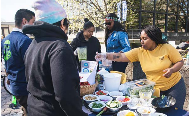
Volunteers from the Herbert H. Lehman Food Bank teach students how to prepare healthy dishes.