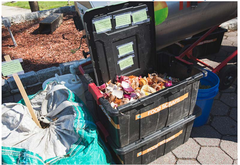
Starting materials for compost are fallen leaves from around the campus and foodpreparation scraps from the cafeteria kitchen and the NYC Compost Project weekly food-scrap drop-off.