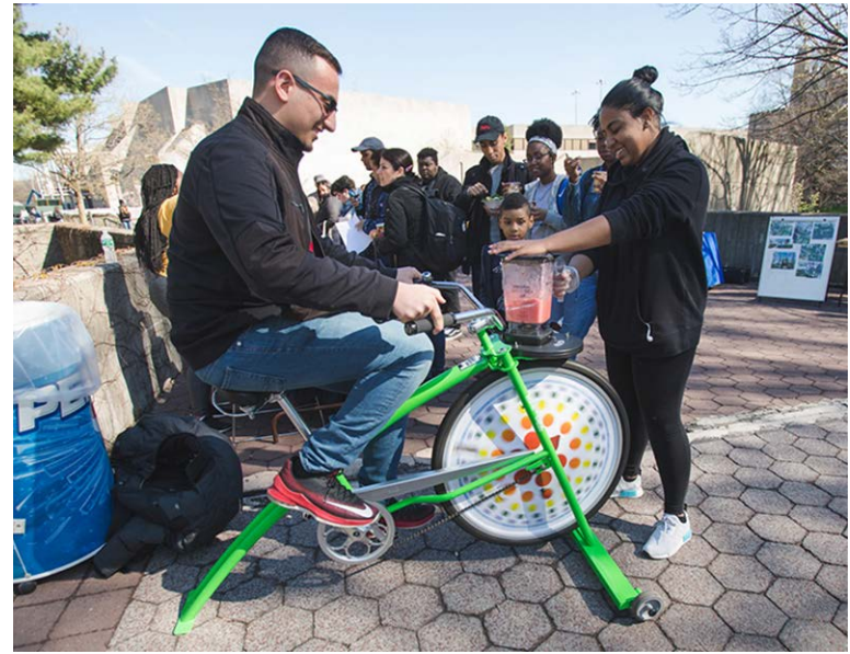
Nutritious, delicious smoothies are created using the bicycle-powered blender.