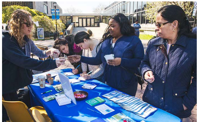
511NY Rideshare was on hand to provide information about ride share, and bicycling commuting in NYC to reduce pollution.

Because Earth Day is observed just once a year, it is imperative to make real changes to our day-to-day habits. We should always consider the impact to the environment in the decisions we make.